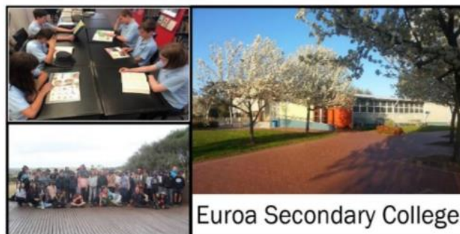
Euroa Secondary College

CHALLENGE EMPOWERMENT RESILIENCE RESPECT