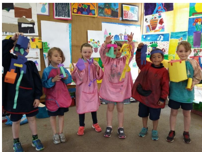
Grades F/1 with paper sculptures.

Grades 5/6 D & K will continue printing, drawing and painting the wall panel design outside the Art room.