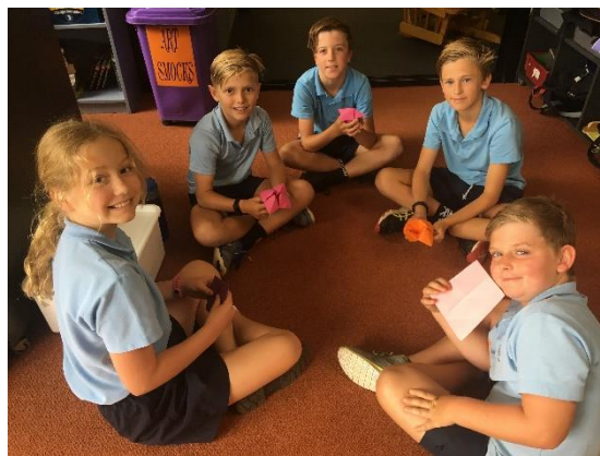
Students from 5/6D&K working together showing unity...