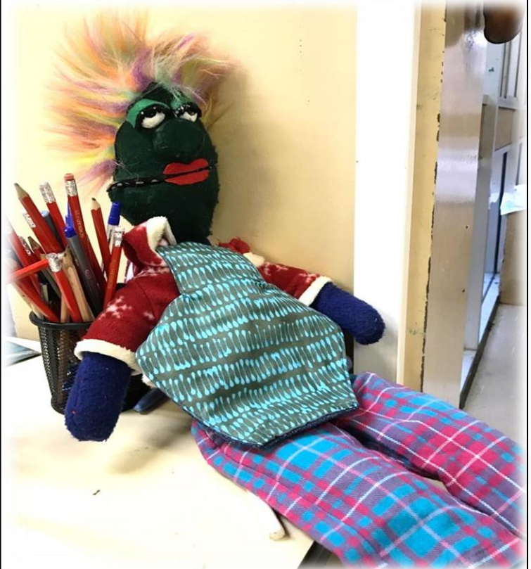
Meet Iris!, Our class mascot and inspiration.