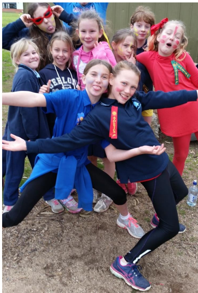
Having fun at Senior School Athletics day