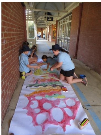
The Big Mushroom

Students are becoming very confident expressing their ideas with the different media in the Art room. Everyone is looking forward to the school art exhibition at the end of May in the School House. Some grades have looked at the space where their work will be hung and have realised that art work will need to be large and colourful. We plan to have a mushroom forest and a mushroom café. It is all going to be very exciting and a lot of fun.